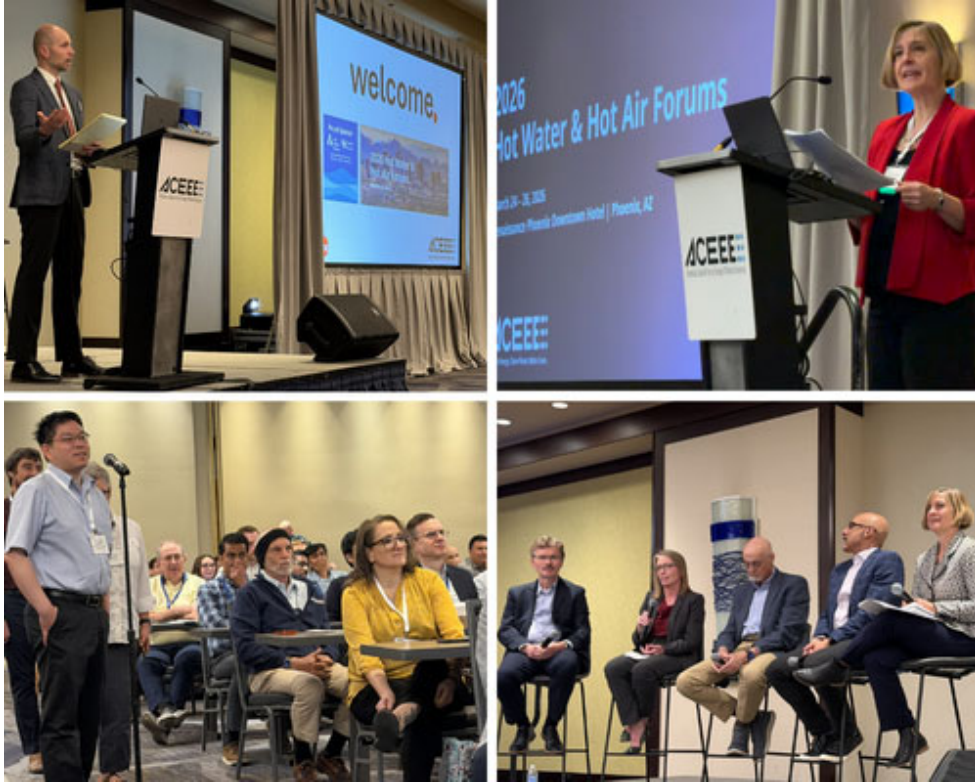
Scenes from ACEEE's 2026 Hot Water & Hot Air Forums