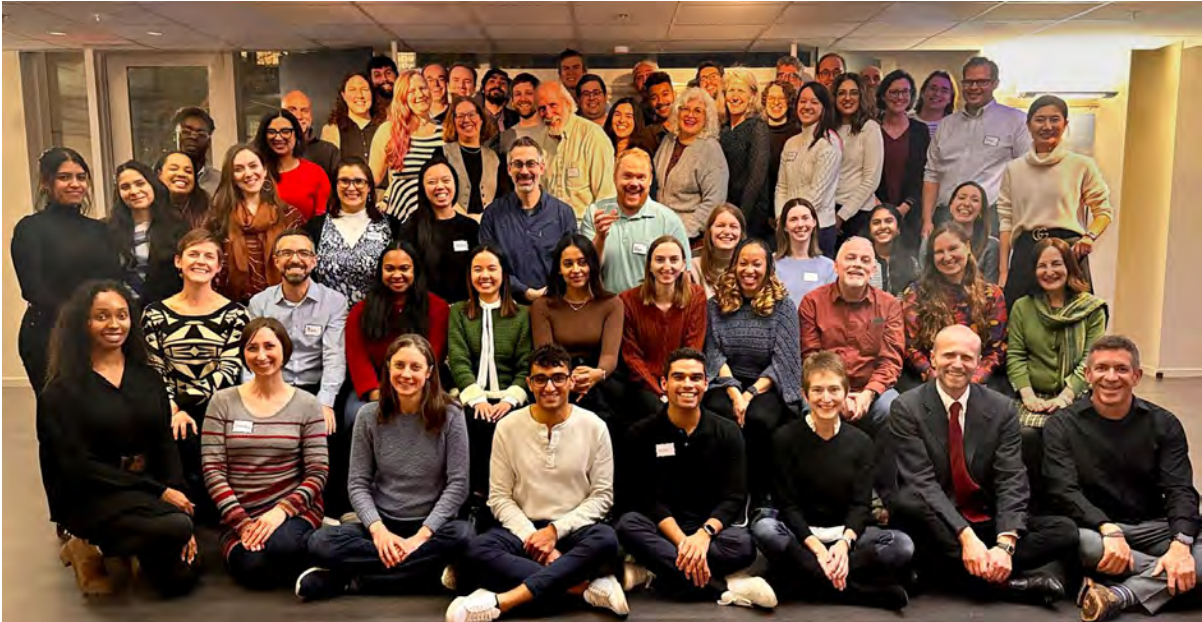
The ACEEE team gathered in Washington, DC, for a retreat and holiday celebration.