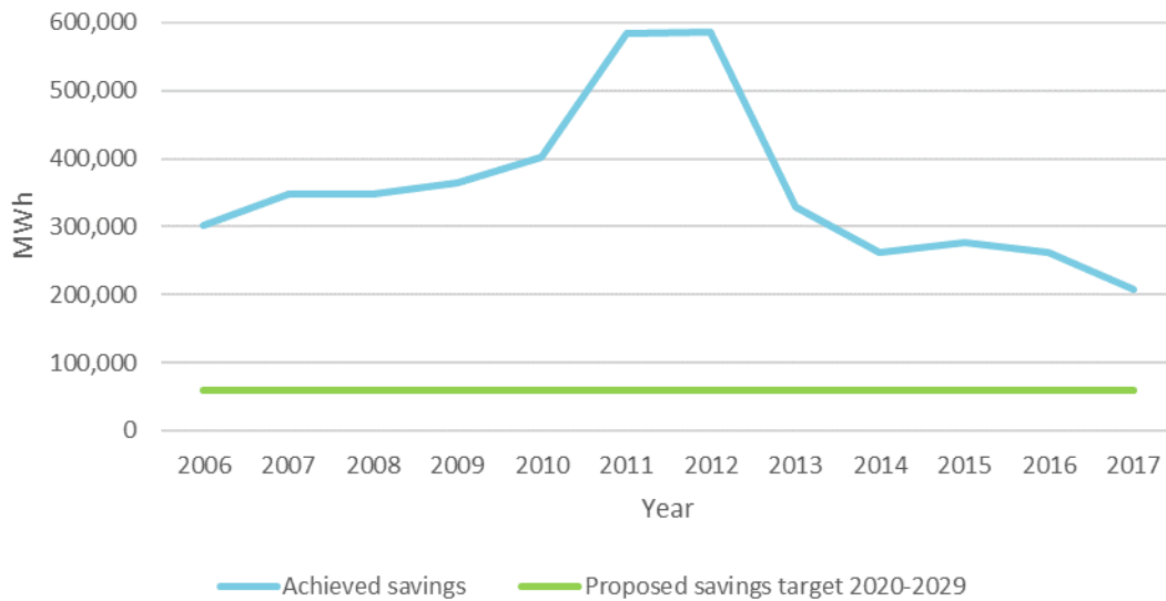
Aggregate savings proposed by FEECA utilities (green) as compared to achieved savings in past years (blue).

Significant energy savings opportunities remain in Florida. Utilities in neighboring states have shown that achieving much higher levels of savings is possible. For example, Duke Energy Carolinas (North Carolina) and Entergy Arkansas, Inc. saved 0.93% and 1.79% of 2017 annual retail sales, respectively. 6 Moreover, in 2017 thirteen states saved at least 1% of retail electricity sales through energy efficiency programs. 7 These utilities are investing in a range of programs targeting different customer segments and end-uses, including high-efficiency appliances and consumer electronics, custom programs for large energy users, and mid-stream programs that deliver savings to customers at the point of purchase. 8 In nearly all cases, these high savings are driven by ambitious but achievable goals set by regulators.