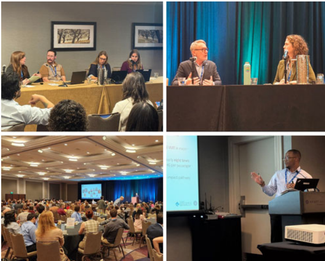
Scenes from the 2025 Behavior, Energy & Climate Change conference in Sacramento, California, co-convened by ACEEE