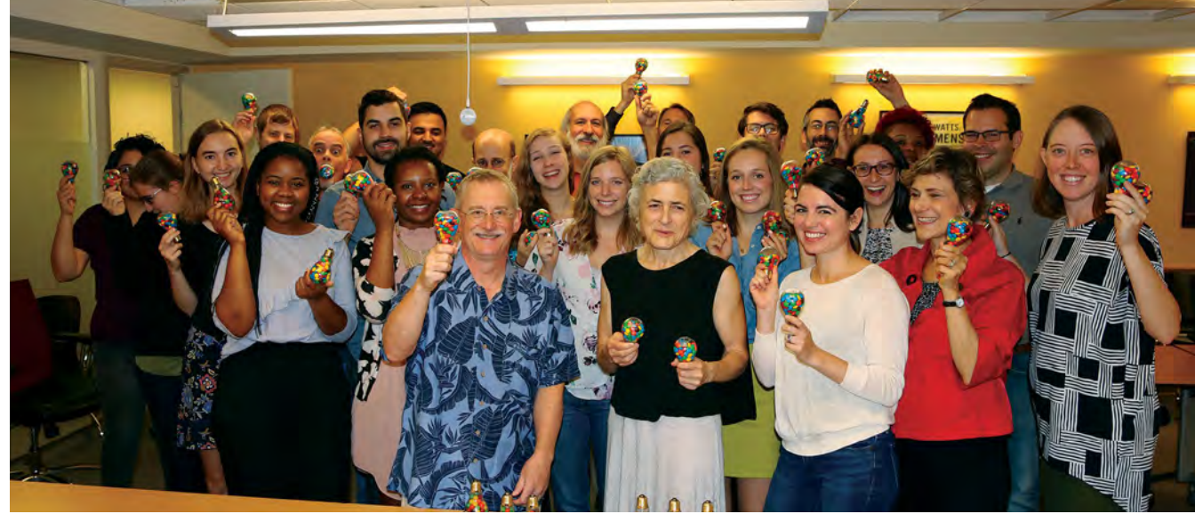
ACEEE helped plan the third annual Energy Efficiency Day on October 5, 2018, officially recognized in proclamations by the US Senate and 57 cities, counties, states, and universities.