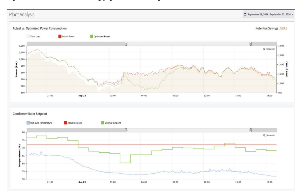
Figure 3. Screen shot of the condenser water temperature setpoint optimization features in the PlantInsight tool.