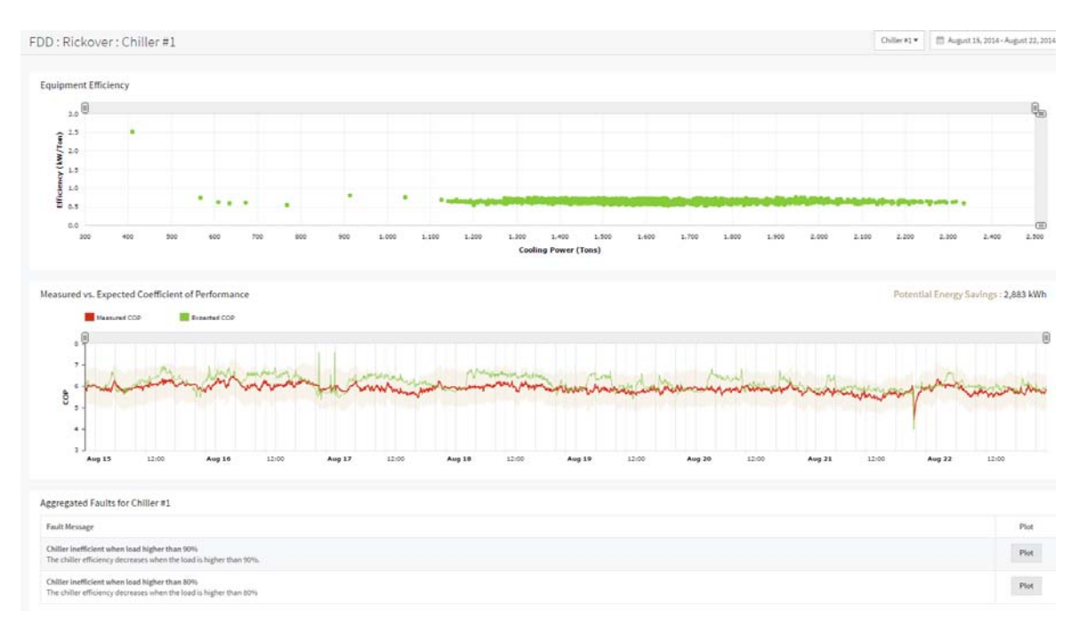
Figure 4. Screen shot of the fault detection and diagnostic features in the PlantInsight tool.

Figure 4 shows the fault detection and diagnostic features in the tool. In the upper plot, the chiller efficiency curve is plotted with kW/ton on the y-axis, and cooling tons on the x-axis. In the bottom plot, a time series of detected efficiency faults is provided. A time series of the measured coefficient of performance (COP) is overlaid with the model-predicted COP; when the two values diverge beyond a threshold size and probability, a fault is detected. Diagnostic fault aggregation to group faults instances based similarity of conditions is summarized in the lower right hand portion of the plot. Please refer to the section FDD and Optimization Algorithms for further description on how faults are detected and grouped for diagnosis.