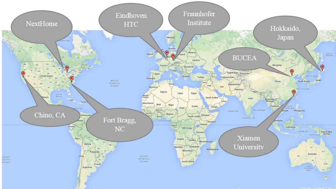
Figure 2. Worldwide Demonstration Sites for DC Distribution in Buildings