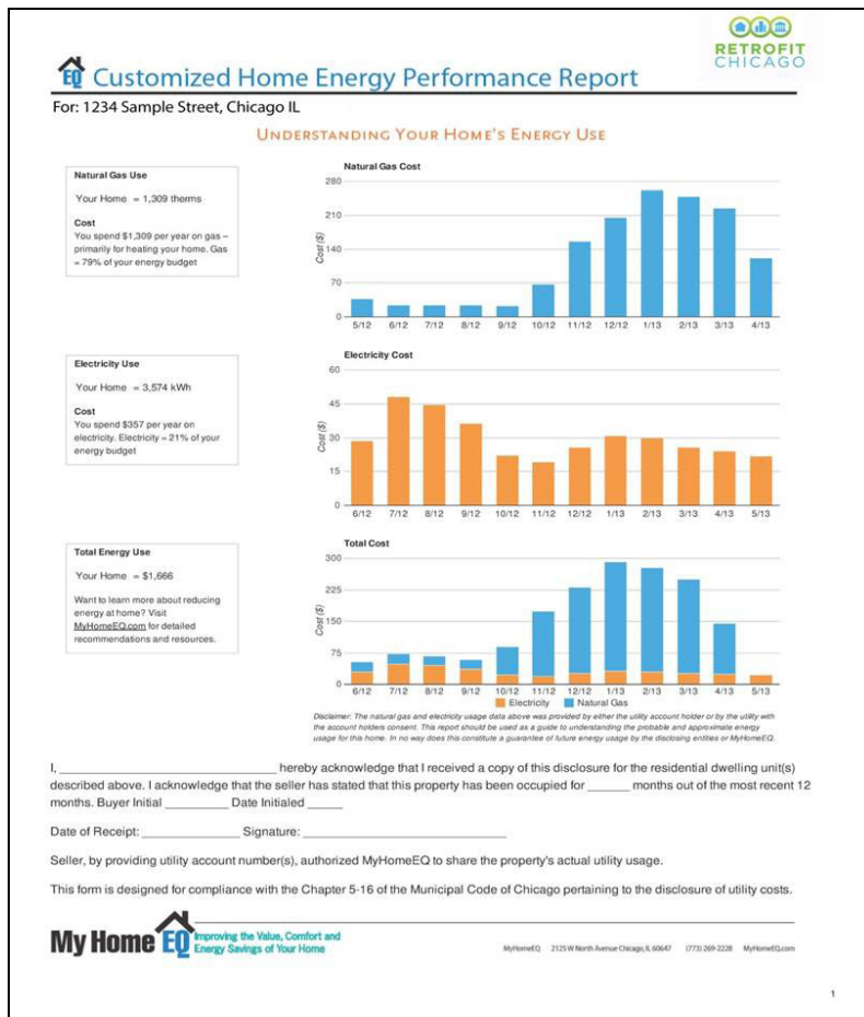
Figure 4: Sample detailed home energy report generated by MyHomeEQ. Energy consumption is displayed alongside energy costs.

The entire exchange happens within the listing entry screens, behind MRED’s password-secured system. This mimics the privacy approach defined in the original ordinance. MRED users are then prompted to download an optional detailed energy use report. The report, displayed in Figure 4 below, can be attached to the listing in a few clicks, and makes it easy for potential homebuyers to understand the energy use of a property they are considering.