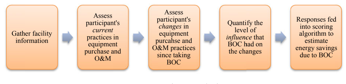
Figure 2. Basic structure of interview guide for certified building operators