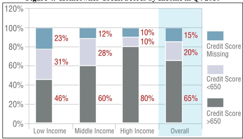
Figure 4. Homeowner Credit Scores by Income in Q4 2010