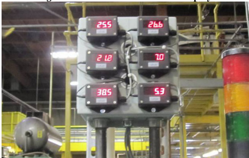
Figure 2. Installed air flow meter displays

Figure 2 shows 6 of the 40 flow meters that have been installed, and Figure 3 shows sample data depicting how compressed air flow is being monitored.