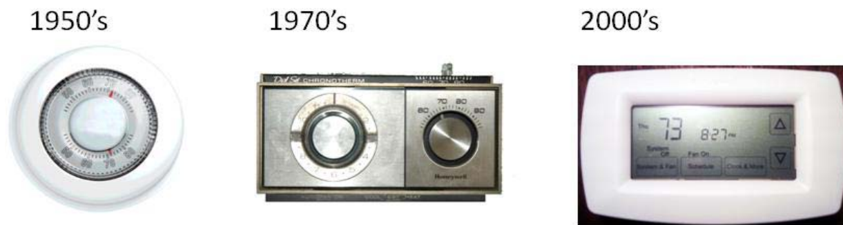
Figure 1: A Round Thermostat, A Clock Setback Thermostat and Touchscreen Programmable Thermostat

US residential thermostats control HVAC systems that are responsible for roughly 11% of the nation's energy use (Energy Information Administration (EIA), 2008). Government policies, as well as higher energy costs certainly encouraged consumers to install PTs. PTs are now purchased more than any other thermostat design although manual thermostats are still common in existing homes. In 2005 the Residential Energy Consumption Survey (RECS) (Energy Information Administration (EIA), 2005) found the following: