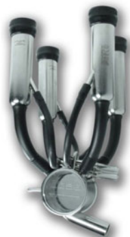
Figure 1. Milking Unit or Milking Assembly

On modern dairy farms, milking is performed by a milking unit or milking assembly (see Figure 1) which consists of a milking claw, four rubber liners, and metal shells or housings surrounding each liner. The claw is a collection point for the milk and is connected to a milk tube through which vacuum is applied to the claw and milk flows down to the collection header. The liner is the part that is attached to each teat and extracts the milk from the cow.