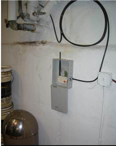
Figure 2. Cable Interconnects and Network Nodes

topographies, separated by streets and clusters of trees, and frequently contain numerous utility owned master meters. Furthermore, without two-way communications as required for transmitting submetering data, there is no reliable means to effectuate central load control of individual apartment heating and air conditioning equipment. Additionally, if existing apartment air conditioners cannot be centrally (or fleet) controlled, there is no mechanism to effectuate widespread demand control and the ability to participate in an effective load curtailment program. Finally, reliable communications is required to transmit and collect submetering data in short enough time intervals to facilitate time sensitive pricing.