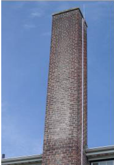
Figure 4. Multi-Directional Antenna

electricity) and the green light depicts an Off-Peak Pricing Period (least expensive electricity). The LEDs provide indication to the apartment resident which pricing period is in effect to assist him/her in modifying his/her usage patterns in accordance with the schedule depicted in Figure 7. The intent of the LED feature is to reduce peak usage and shift the overall demand to Off-Peak periods, thereby saving the apartment resident some money and working toward eliminating the threat of power outages caused by excessive peak demands on the utility grid.