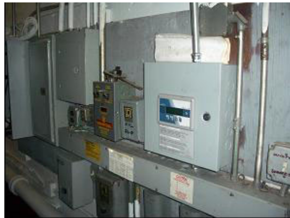
Figure 5. Intech21 Heat Controller

The air conditioner control and communications module package, which is installed as part of the chassis, was developed by Intech 21 and includes a multitude of capabilities to provide maximum flexibility in applying various control strategies. For example, the ability to control the compressor separately from the air conditioner recirculation blower and the ability to remotely adjust the thermostat setting to effectuate fleet load control, reduce usage and demand and minimize tenant inconvenience were also primary design objectives of this project.