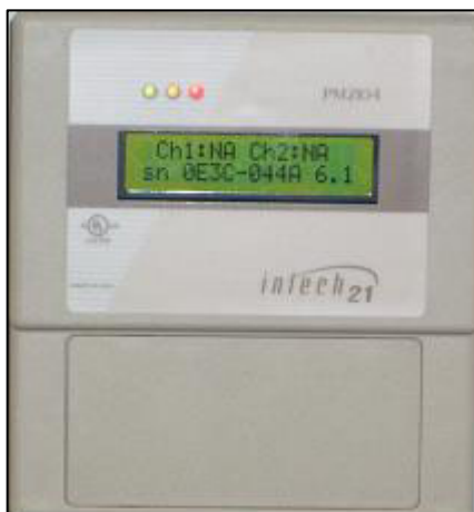
Figure 6. Typical Apartment Submeter with LED Lights

selected air conditioner manufacturer (to be selected) were to jointly develop and provide up to 100 individual through-the-wall room air conditioners which would be centrally (fleet) controlled utilizing the installed communications network, as well as being individually controlled by utilizing the integral apartment temperature sensor as a thermostat.