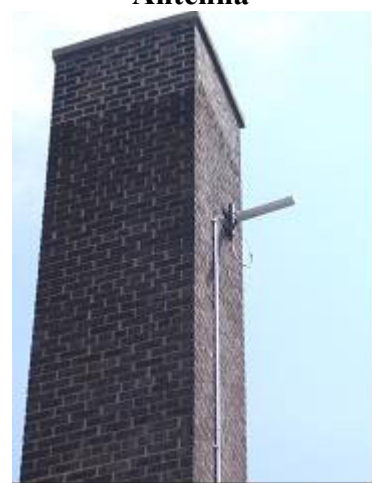
Figure 3. Directional Antenna

Individual submeters were installed inside each apartment at additional cost, as opposed to adjacent to dedicated apartment circuit breakers in the basement area. This allowed it to take full