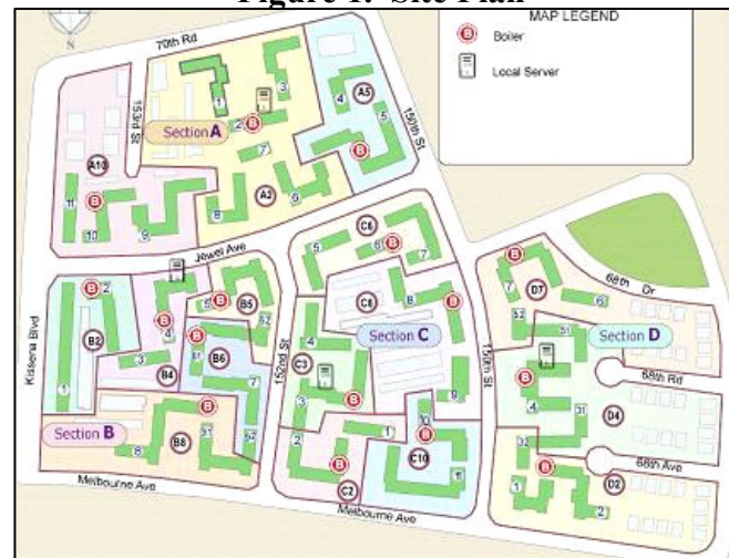
Figure 1. Site Plan

As previously mentioned, many residential buildings throughout New York State have been unable to cost-effectively implement existing submetering technologies due to inherent communications limitations and their associated high cost. This is often the case in garden type apartment complexes which are usually spread out over substantial areas, often with varying