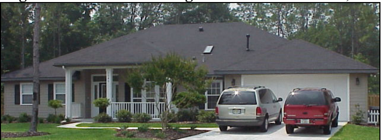
Figure 1. An Atlantic Design Home in Gainesville, FL

firm now directly employs 15 full-time employees and sells about 50 - 60 homes a year. See Figure 1 for a typical home. Like any business, AD is interested in both short-term and long-term profitability.