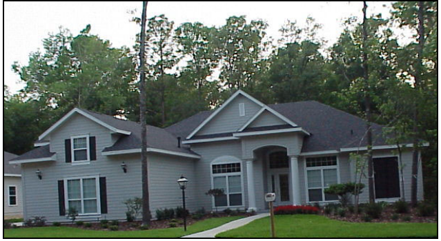
Figure 2. Home built by GW Robinson, Gainesville, FL

handler located within the thermal envelope; programmable thermostat; cellulose insulation (Figure 7), passive outside air and new quality assurance procedures.