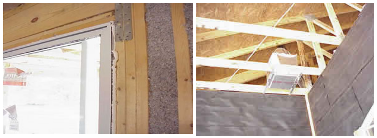
Figure 8. Outside Air Provides Controlled, Filtered Fresh Air while maintaining Household at Positive Pressure with Reference to Outside Pressure