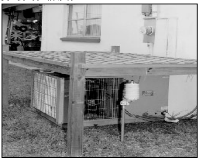
Figure 6. Trellis Shading Device Built over the Condenser at Site #2