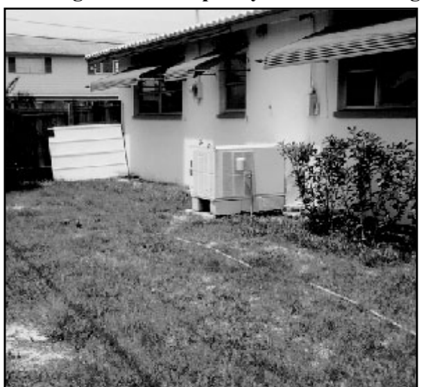
Figure 7. West-facing AC Condenser Shading at Site 3 before Landscaping (Left); Planting of Four Crape Myrtles for Shading (Right)

maximum afternoon shade of the AC condenser unit while particular care was taken to ensure that neither intake nor exhaust airflows were impeded. An automated watering system was set up to provide drip irrigation during evening hours.