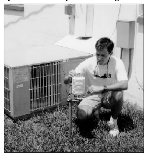
Figure 2. A Research Engineer Adjusts a Pyranometer Leveling Base on the Apparatus Used in the Measurement of Condenser Air and Insolation Conditions at Site 2 (Left); Example of Roof Top Meteorological Station (Right)

A multi-channel datalogger recorded AC electrical demand as well as air temperatures, insolation and other weather conditions. Instruments were scanned every ten seconds with integrated values output to storage on a 15-minute basis. Temperature and solar irradiance were also collected one foot away from the condenser inlet. Figure 2 shows the installation of the temperature and insolation apparatus to collect this information by the AC condenser in one of the experiments. Temperatures were obtained using calibrated type-T copper-constantan thermocouples with a relative accuracy of 0.05°F (0.03°C). Special attention was given to proper shielding of air temperature probes to minimize experimental error associated with the influence of solar radiation (Sonne, et al., 1993).