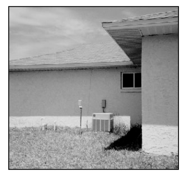
Figure 3. West-Facing Condenser at Site 1 Prior to Landscaping (Left); Final Appearance after Tree Planting (Right)