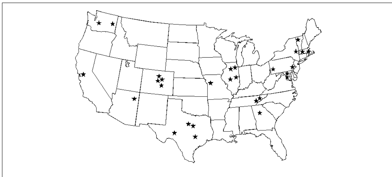
Figure 1. Project Locations

The following discussion highlights the five categories of projects conducted with Initiative funding and describes some significant results.