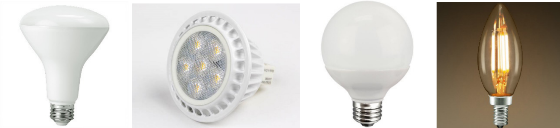
Figure 2: LED reflector, MR, globe, and candelabra bulbs.

In part due to later restrictions placed by Congress, DOE did not meet the statute's timetable, and the backstop has been triggered. However, as required by Congress, DOE did complete rules to define the scope of bulb types covered by the backstop standard.