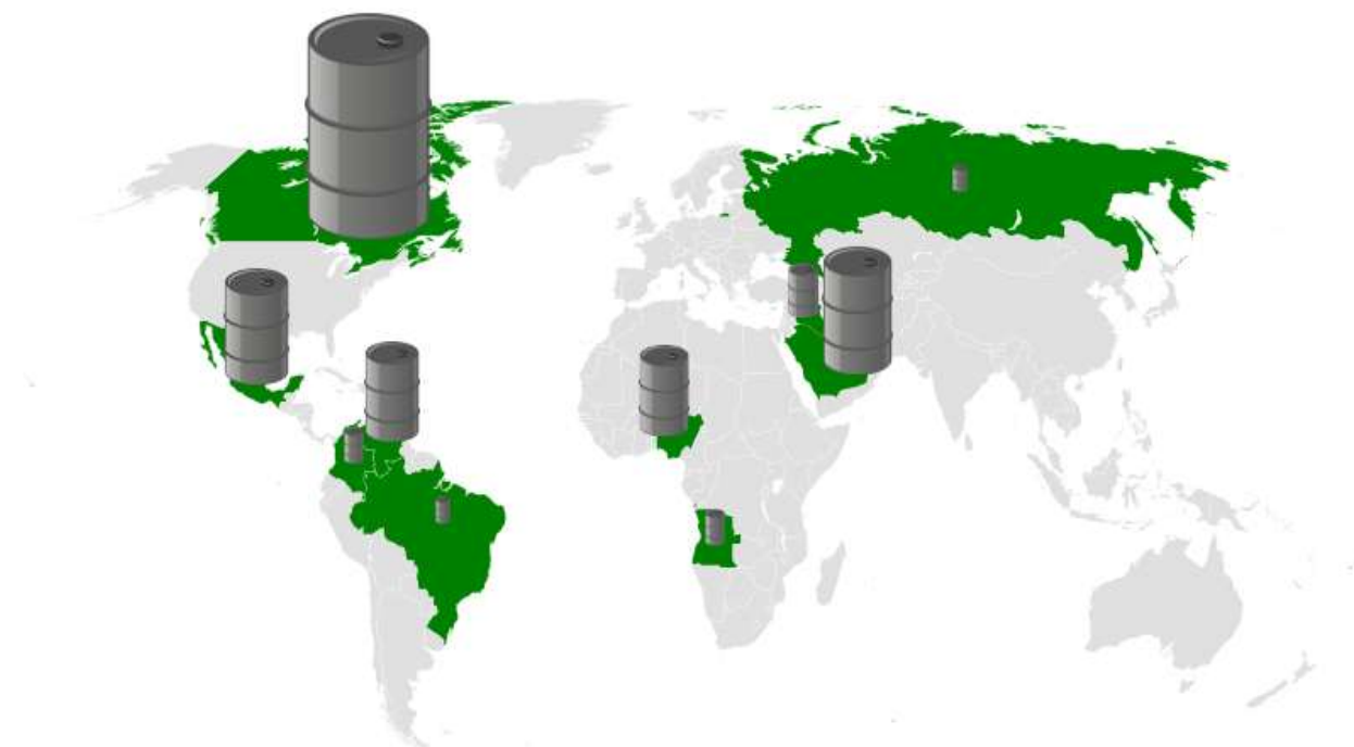
Figure 2. Top Ten Suppliers of Crude Oil to the United States

Note: The size of each oil barrel is proportional to the percentage of imported oil originating in that country.