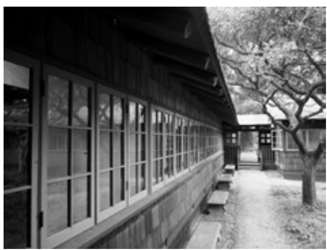
The Stuck-Up Inn.

In his elegant letter of nomination, Michael Graves, AIA, winner of the Gold Medal in 2001, describes her long-term influence and lists features of her artistry that today's energy-efficient home would benefit from: "...reciprocity between architecture and landscape, her embrace of local history and context, her use of local and long-lasting materials, her creation of spaces that dignify the soul..."** A well-sited, durable building made from locally available materials, that cooperates with its environment taking into consideration climate and the sun's path over it doesn't need high-end measuring devices, switches and automation. All such a building needs is a loving occupant who knows how to operate a window, curtains, and make a fire.