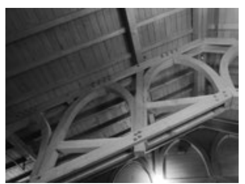
Merrill Hall Trusses.

following year, was turned down again, and spent the time wisely, sharpening her talents by studying local architecture and fine art. In spite of their resistance to admit a woman to the program, her